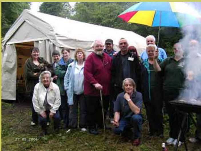
The happy diggers